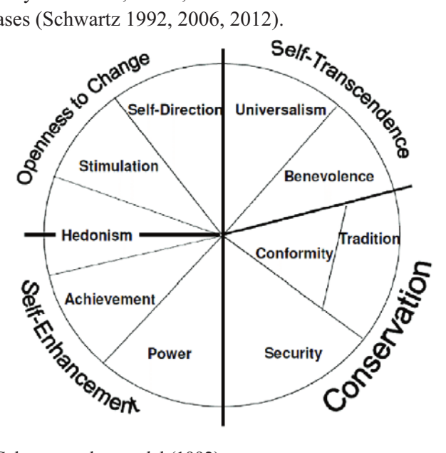
Figure 1 – Schwartz value model (1992)

self-direction, stimulation and part hedonism. On the other side, the higher order value of conservation consists of the values of tradition, conformity and security. Universalism and benevolence constitute the higher order value of self-transcendence , and the values of power, achievement, and in part hedonism constitute the higher order value of self-enhancement . As shown in Figure 1, the values of openness to change and conservation are mutually on opposite sides of the circular representation and are negatively correlated, that is, as the value of one value increases, the value of another decreases (Schwartz 1992, 2006, 2012).